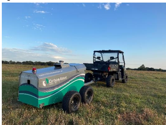
Figure 4: Device for in-situ measurement of soil carbon based on inelastic neutron scattering.

30 cm topsoil layer is measured at once. Built as a compact integrated and mobile device, the measurement apparatus is promised to be flexibly deployable in the field and moved easily, thus enabling high coverage while being pulled across a field. The device measures total soil carbon levels. Inorganic carbon is assumed to represent a constant background in the context of carbon accumulation. Concerning measurement accuracy, the solution is advertised as a viable alternative to laboratory-based analyses. Commercial rollout is scheduled for the near future. The resulting data is stored on a distributed ledger database.