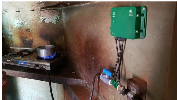
Figure 2: Biogas meter for remote monitoring.