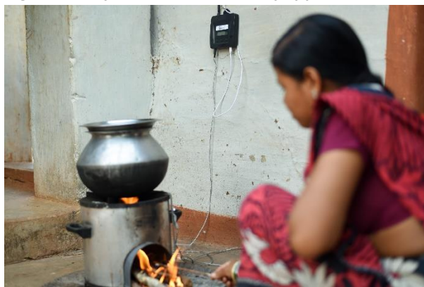
Figure 1: Improved cookstove equipped with a temperature sensor for remote monitoring.