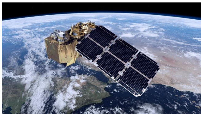
Figure 3: Artist's illustration of one of the two Sentinel-2 satellites whose imagery is used to estimate forest biomass.